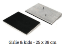
Girlie & kids - 25 x 38 cm